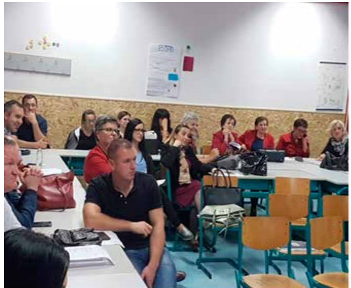
Activities of Action plan in Herzegovina-Neretva Canton (HNC)