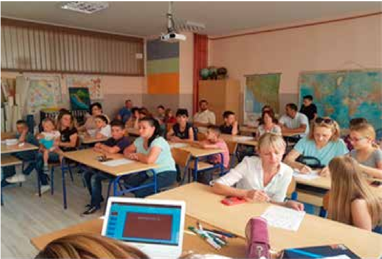
Workshops with parents and pupils in Sarajevo Canton (SC)