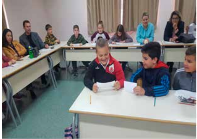
Activities of the Action Plan in Central Bosnia Canton (CBC)